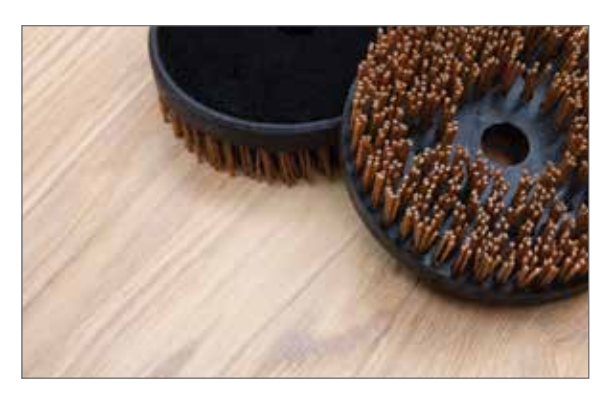
Quick and easy hook & loop attachments.