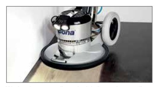
Works closer to walls and minimizes edge sanding.