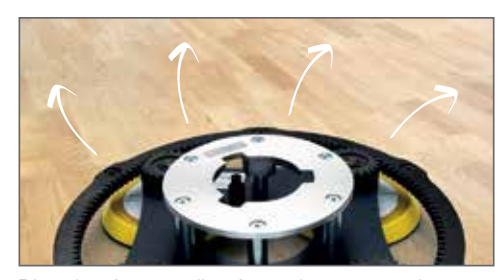
Direction-free sanding for optimum smoothness.

With large wheels and a compact design, the Bona Power Drive can be easily moved between rooms and up and down stairs.