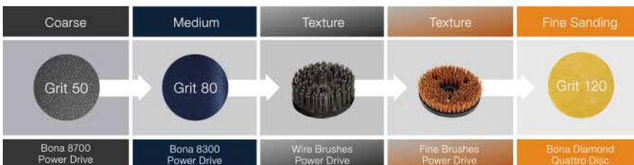
Sanding sequence for Brushed