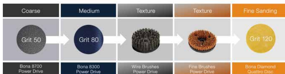
Sanding sequence for Brushed