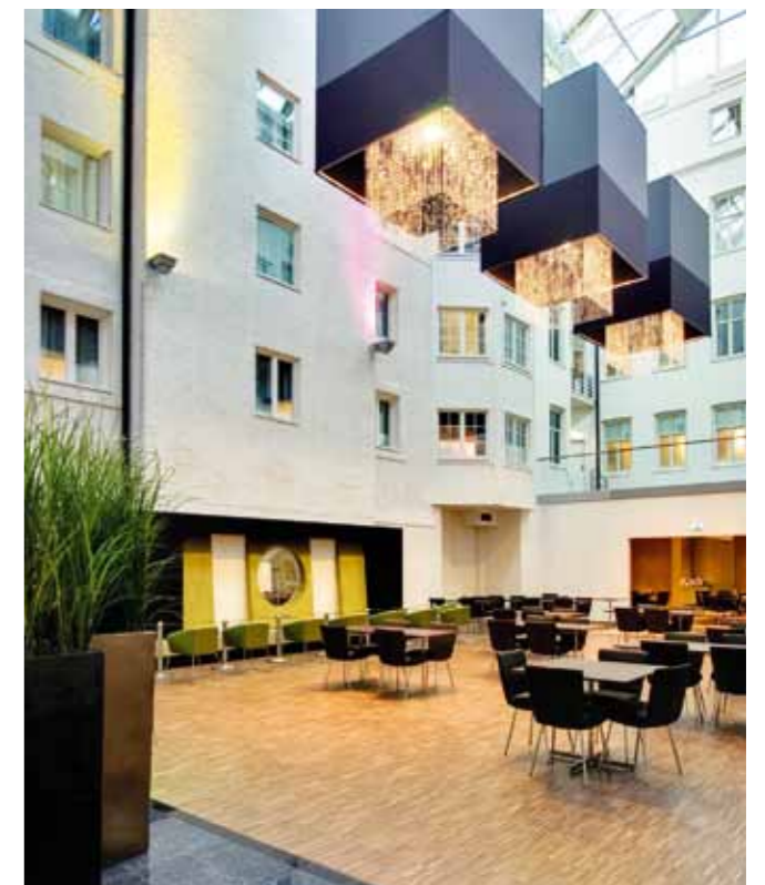
When installing and treating 300m 2 of walnut parquet at Clarion Hotel Plaza in Sweden, the contractor used the entire Bona System.

To architects, designers and craftsmen alike, Bona is able to provide the solution whether there is a need for rapid fastening, high wear resistance or a natural look. We guarantee compatibility and simplicity on every level.