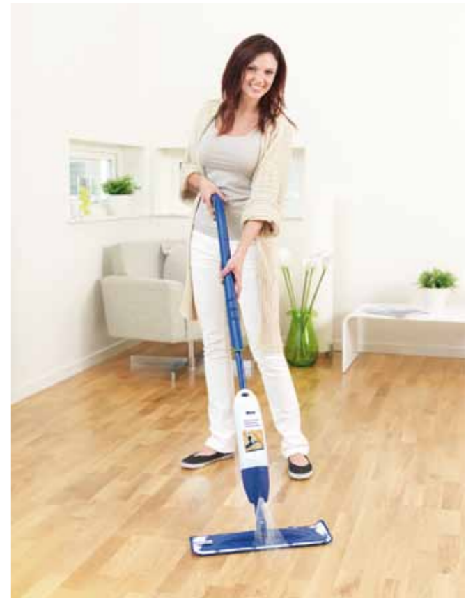
Bona Spray Mop

Because wood is different from other flooring materials, it requires special cleaning and maintenance products to retain its beauty. That's why Bona offers a full range of maintenance solutions, to support the coating of the floor.